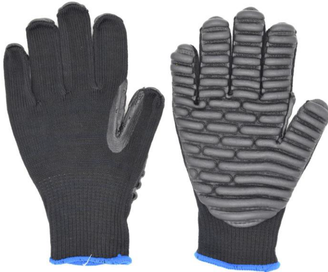
Image of reducing Vibration