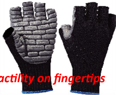
7 gauge finger-cut liner