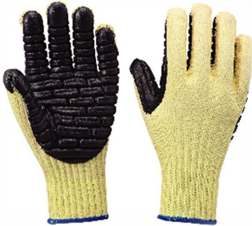
7 gauge liner